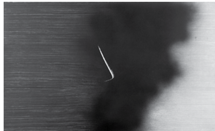
Hans Hartung, T1962-E1, 1962

Available in the Kunsthalle Praha Design Shop and at www.shop.kunsthallepraha.org/en/