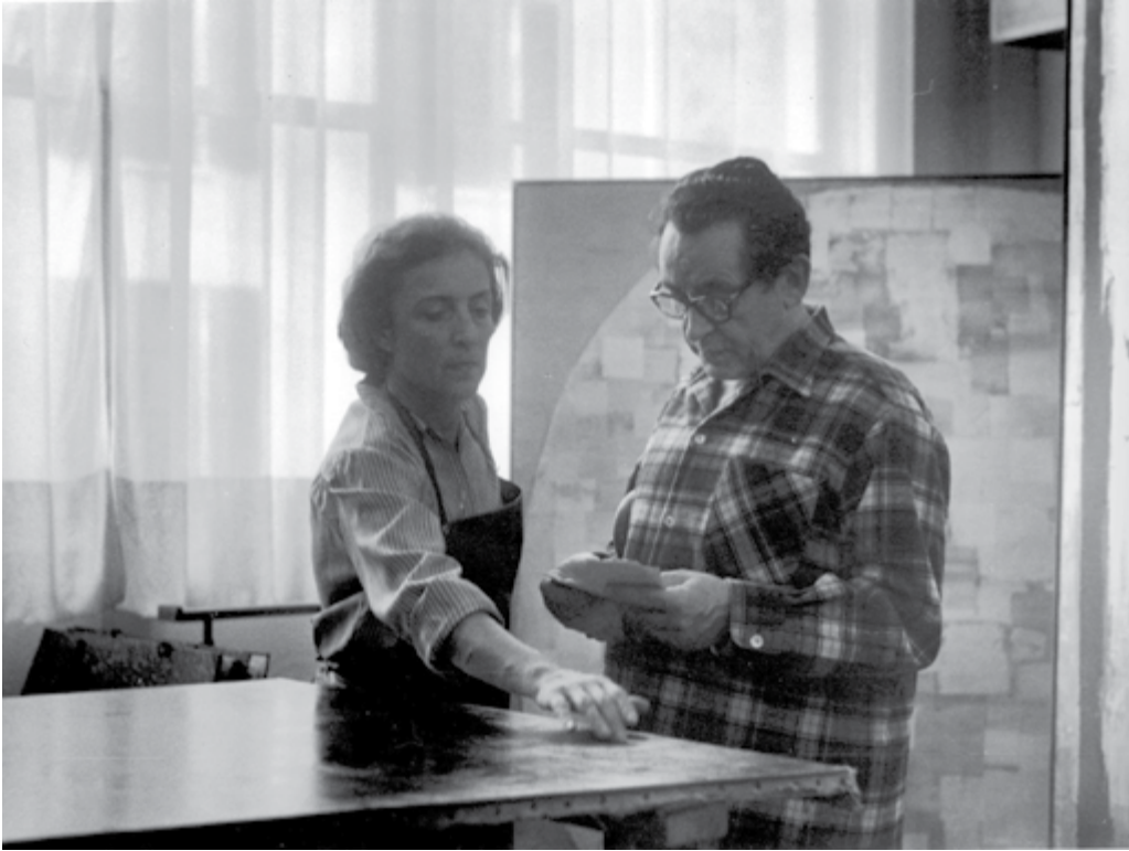
COVER PHOTO: Anna-Eva Bergman and Hans Hartung, Leucate, 1929