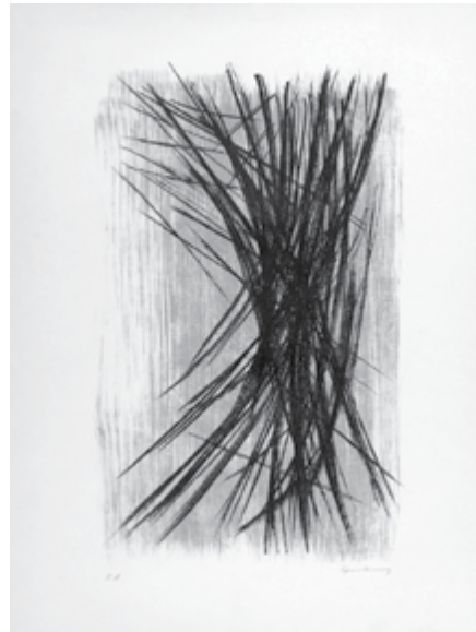
Hans Hartung, L 10, 1957